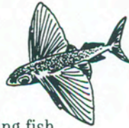
5. Flying fish