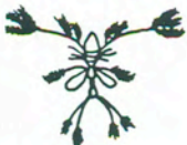
19. Copepod larvae