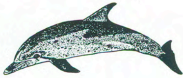
1. Atlantic spotted dolphin ( Stenella frontalis )