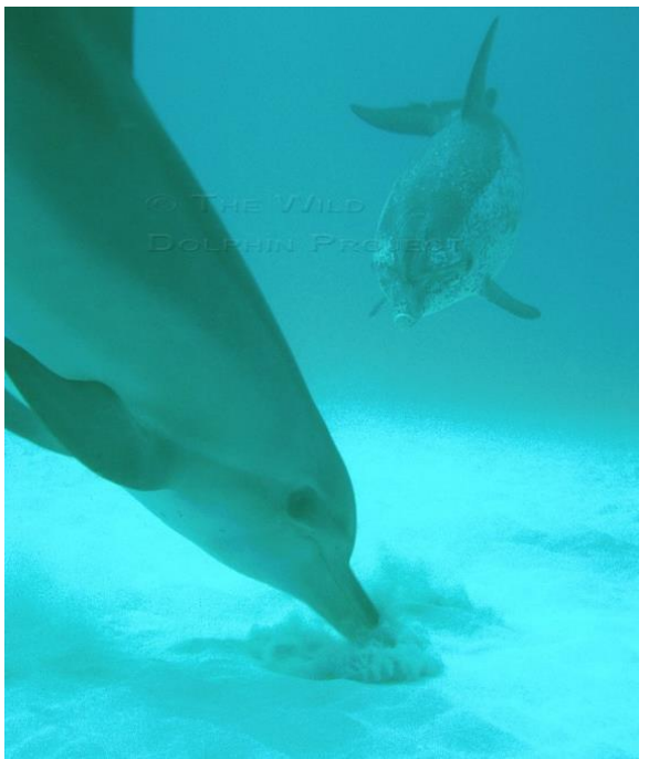
Figure 1. A spotless two-tone calf digs in the sand for fish while being watched by an elder dolphin.

A play-forage juvenile subgroup was defined as a group of three to five juveniles that+ display foraging behavior while socially interacting and swimming together at the bottom of the sea. The relative age of the juveniles in each group is visibly distinguishable via skin pigmentation and/or body size in cases where individual identification was unavailable. A benthic foraging sequence in juvenile subgroup was defined as the period between the start and the end of a benthic-feeding event in subgroup. The sequence starts when an individual initiates scan, dig or chase. The sequence ends when one of the following cases occurred: fish chase is over because fish escapes or is ingested, subgroup dissolves or subgroup leaves benthic area. The videos (n = 8) were selected for the presence of foraging juveniles and were included in the analysis as long as the focal juveniles did not go out of the video for more than three seconds in play-forage subgroups.