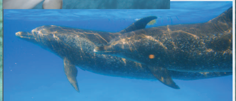
Long-term male alliance Big Gash (back) and Romeo (front), both at least 40 years old