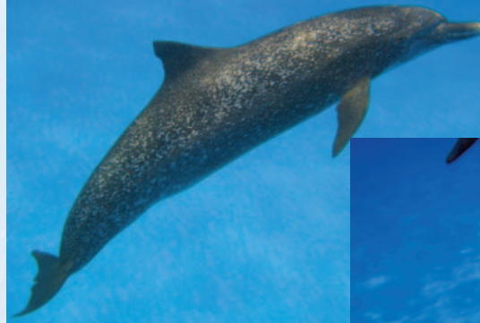
Stubby - at least 40 years old!