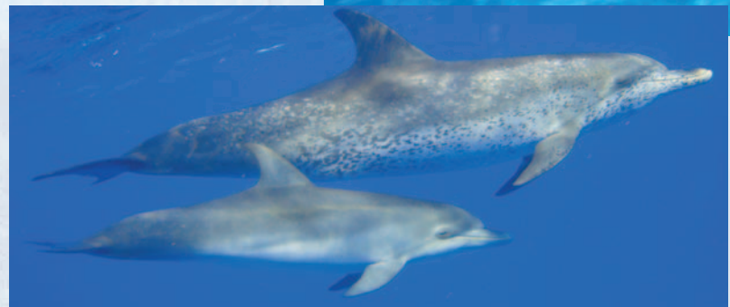
Lava (13 years old) and her first calf, Legend (male, born this year!)