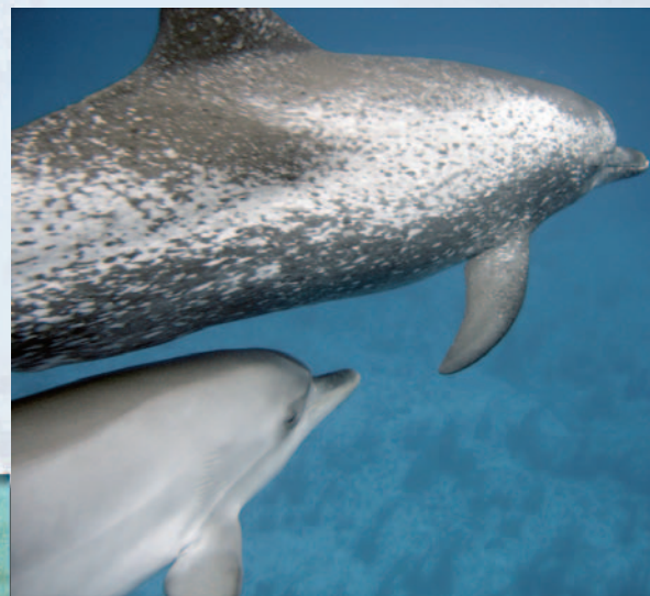
Lava (13 years old) and her first calf, Legend (male, born this year!)